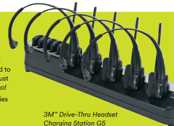
3M™ Drive-Thru Headset Charging Station G5